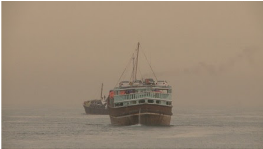
CAMP, From Gulf to Gulf to Gulf (still), 2010, color video projection with sound.